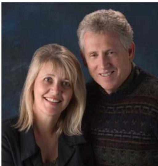
Formal business photo

MAJOR ANNOUNCEMENT: Our company Publishing Syndicate will become a full-fledged publishing company in 2011. Having worked under book contracts with major publishers since the mid-1990s—and experiencing the ups and downs of such relationships and the publishing industry as a whole from an author’s POV—one realization kept nagging at us: “We can do this better.” After much research, we realized that the social media angle and those related business opportunities in regards to the ever-changing world of publishing were just too good to ignore. Typically, most traditional publishers are so big that they can’t incorporate such swift changes in social media as a smaller publisher can, thus our reason to jump ship, cancel book deals and dive into the business ourselves. Are we crazy to be expand-