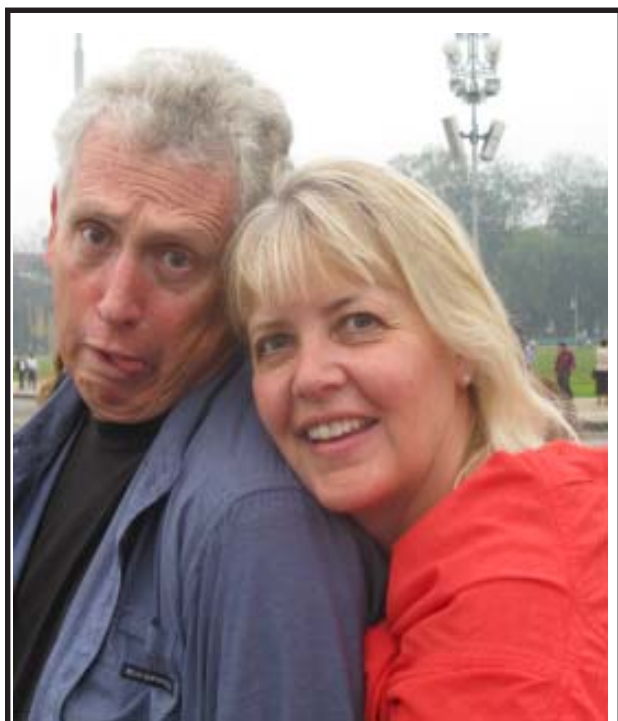
Goofing off in Hanoi, Vietnam

As of right now, we will concentrate on our Wine Wherever book series, releasing three books in 2011, along with the first Wine Wherever cookbook. And we’ll more than likely re-introduce our planned anthology series, slated for release in 2012, which means we’ll start accepting stories in mid-2011. Other plans include a full line of teen and preteen